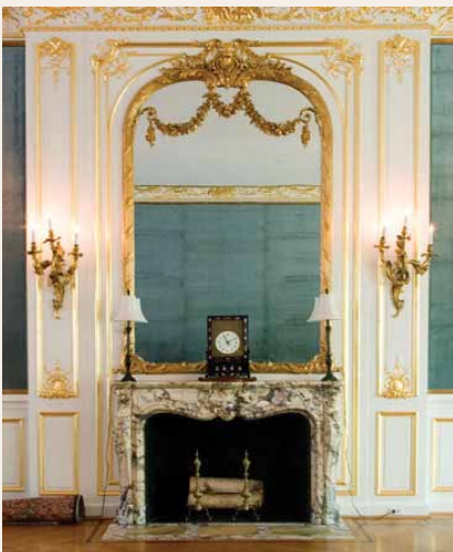
Drawing Room Gas-flame logs

The Drawing Room restoration, complete with gold leaf, a custom-woven Stark rug, and portraits of the Garretts, was completed in 2007.