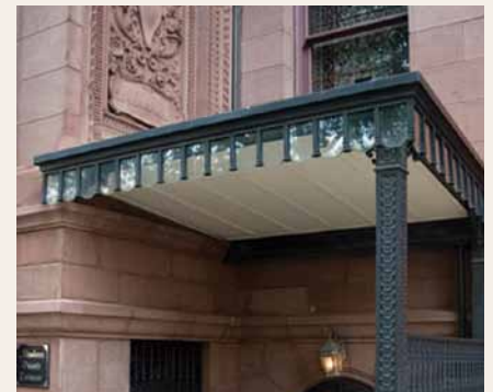
Front Lower Entry

by Stanford White in 1884 and extended by John Russell Pope in 1902, the addition was suffering from decades of visible erosion and awkward attempts at repair. The project included removing previous patching and coating compounds, the repair of broken and flaking details, and the repair and painting of windows. Large stone elements of the façade, such as the roof and porch balustrades were included.