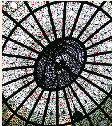
Tiffany Spiral Dome

It is a celebrated venue for events for decades to come. Also, this room was modernized with fire protection sprinklers, concealed emergency lighting, an updated fire alarm system, and increased power for events. No more extension cords. This restoration was granted a Project Award by Baltimore Heritage, Inc. The first floor Ladies Room was renewed in 2007. The Tiffany Glass restoration involved two matching windows in the spiral staircase. The scope of this work included strengthening the protective metal cages outside the windows, replacing the frames and hardware, and the complete cleaning of all the surfaces. This project's funding was made possible in part by the 2006 Heritage Dinner.